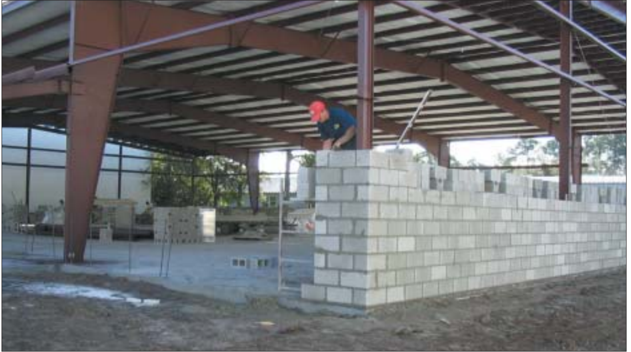
Hills is constructing a new manufacturing facility to further the company's multi-component technology development.

Those who have conceded the manmade fiber business to the Far East probably have never visited Melbourne, Florida, a small beach community not far south from Cape Canaveral, home of the NASA Space Shuttle program.